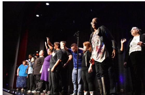
CAU Community Players performing in the 2019 Cabaret.