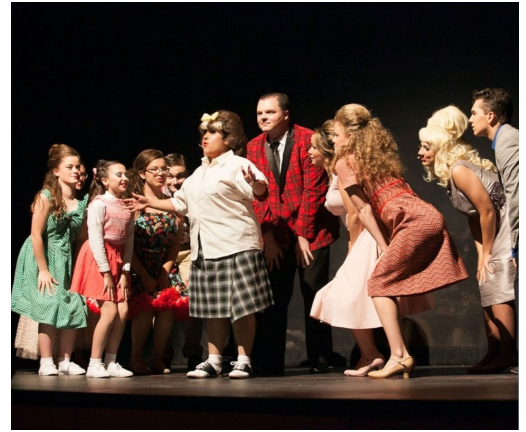
The cast of "Hairspray, Jr." performing on stage.

Naturally, the group opened with "Cabaret," made famous by Liza Minnelli, and closed with Queen's "We are the Champions."