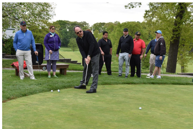
Some of our event supporters enjoying a game of golf.