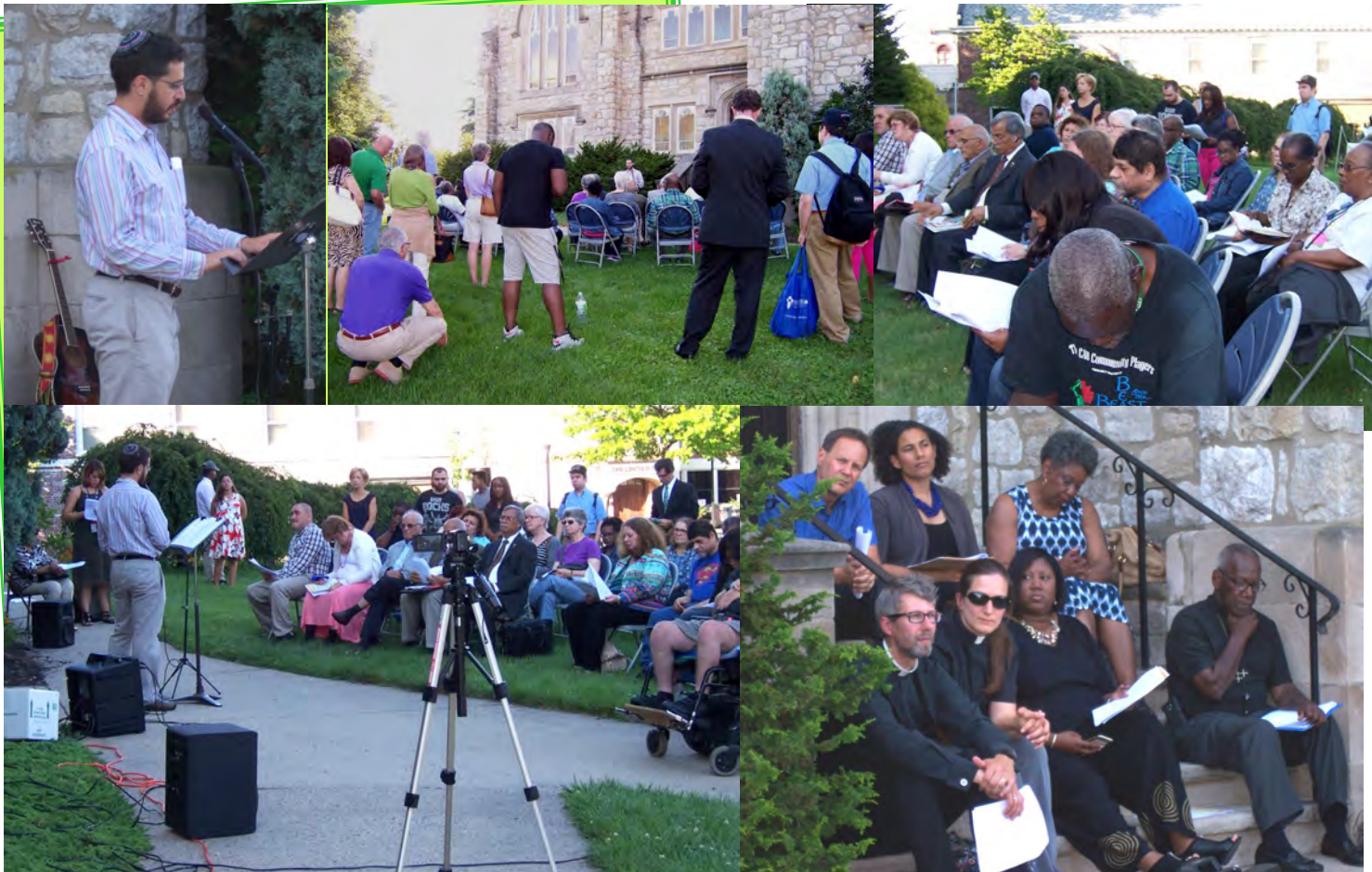
UCICC HOSTS AN INTERFAITH PRAYER VIGIL ON JULY 19TH AT FIRST UNITED METHODIST CHURCH IN WESTFIELD.