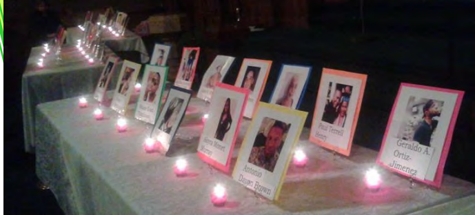
THE CRANFORD CLERGY COUNCIL HOSTS A PRAYER VIGIL JUNE 28TH.