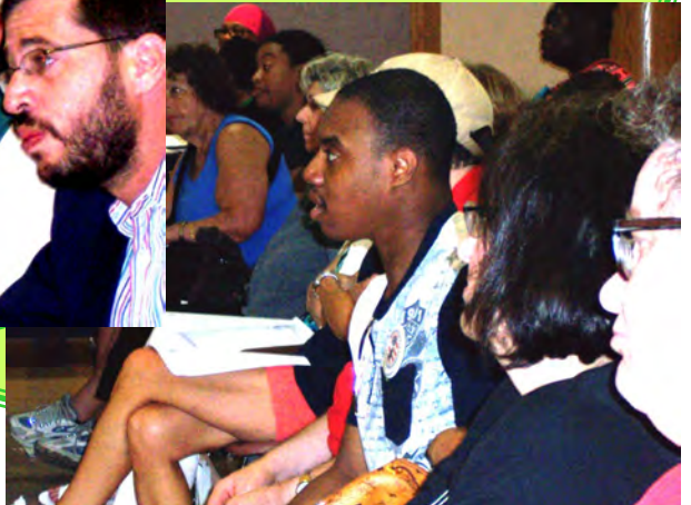
UCICC HOSTS A SPECIAL PROGRAM, "LOVING GOD, LOVING YOUR NEIGHBOR: A CHRISTIAN-JEWISH-MUSLIM PERSPECTIVE," ON JULY 19 AT FIRST UNITED METHODIST CHURCH IN WESTFIELD.